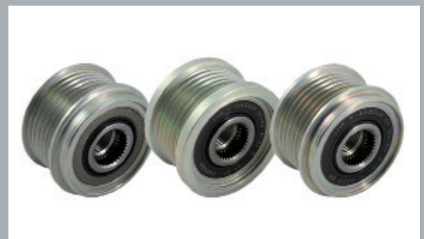
Image 2: Over-running alternator pulleys 55886 (left), 59964 (centre), 59965 (right)