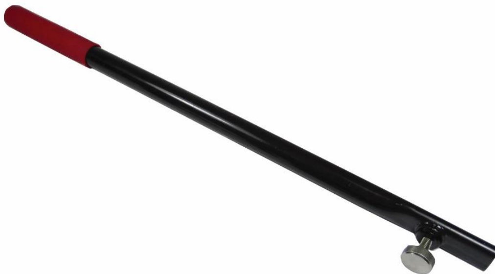
7468-11253 – GAT4939 – Universal Handle for Crankshaft Pulley Holding Tool