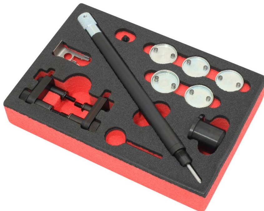
7468-11334 – GAT5225 – Engine Setting and Locking Tool Kit