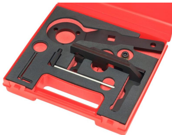
7468-12001 – GAT5148A – Engine Setting and Locking Tool Kit