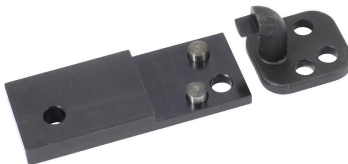
7468-11308 – GAT5299 – Camshaft Locking Tool