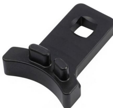
7468-11400 – GAT5259 – Camshaft Sprocket Holding Tool