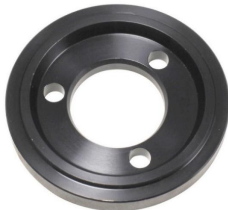
7468-11290 – GAT5257 – Crankshaft Seal Installer