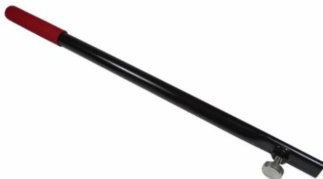
7468-11253 – GAT4939 – Universal Handle for Crankshaft Pulley Holding Tool