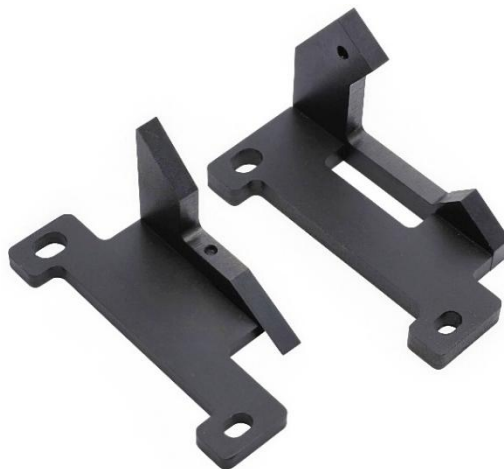
7468-11310 – GAT5295 – Balance Shaft Setting Tool