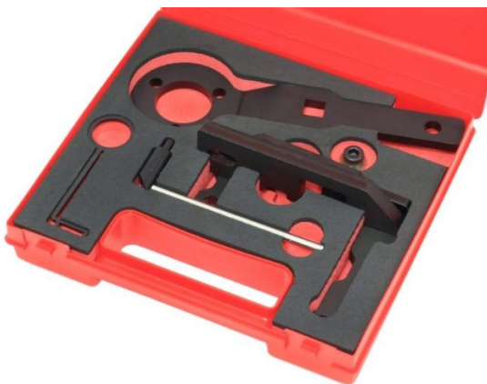
7468-12001 – GAT5148A – Engine Setting and Locking Tool Kit