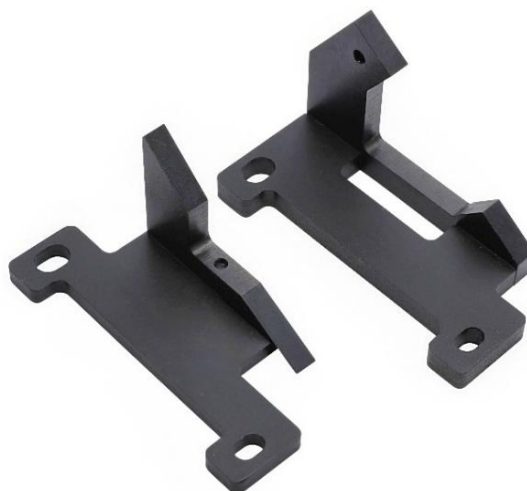
7468-11310 – GAT5295 – Balance Shaft Setting Tool