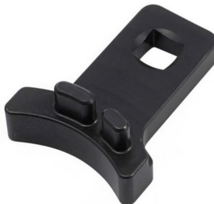
7468-11400 – GAT5259 – Camshaft Sprocket Holding Tool