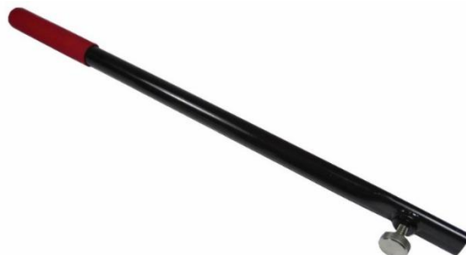
7468-11253 – GAT4939 – Universal Handle for Crankshaft Pulley Holding Tool