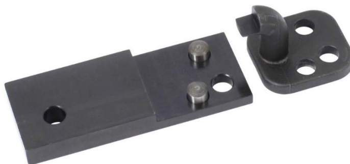
7468-11308 – GAT5299 – Camshaft Locking Tool