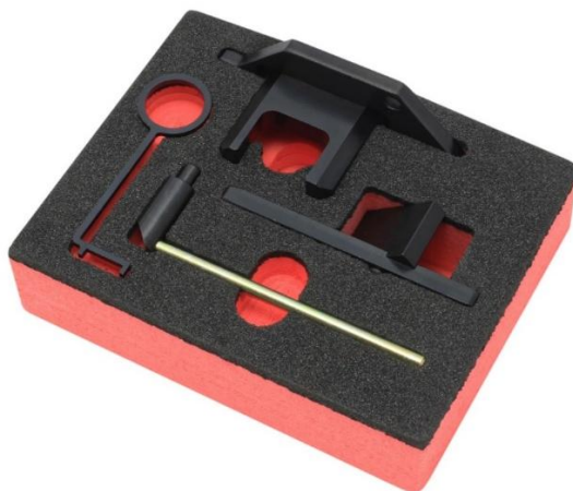
7468-11283 – GAT5255 – Belt-In-Oil Timing Check Kit