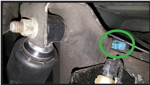
ABS Wiring Harness

When replacing the rear shocks on these vehicles and accessing the upper shock mounting bolts, there is a high probability that the depicted blue electrical connection for the ABS wiring harness will come unplugged. When faced with this error message after performing a rear shock replacement, check their two connectors, located on each side of the vehicle, on top of the frame rail just behind the upper shock tower. Ensure the connections are good and restart the vehicle.