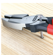
Gripping zone below the joint for powerful leverage