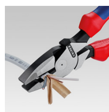
Long cutting edges for cutting flat cables