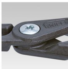
Bolted joint: high precision and smooth action