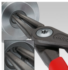
Slim head shape