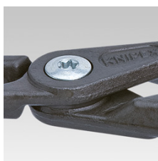
Bolted joint: high precision and smooth action