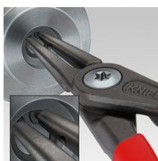
Slim head shape