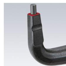
Sturdy, inserted tips: made from high-density spring steel