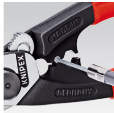
Crimping of the end ferrule onto the traction cable