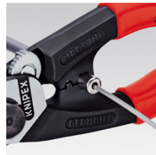
Crimping of the end caps on the Bowden cable sheath